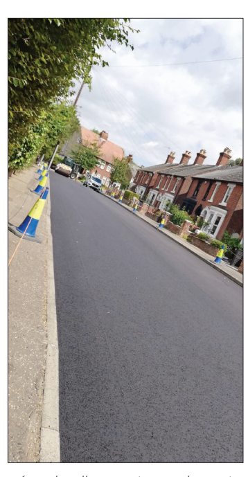
After: The all new Irvine Road, a major step towards improving the visual environment