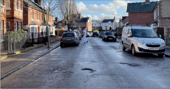
Resurfacing is due soon. Check the Facebook page for more information.

As many of you will have seen, some preparatory tree-cutting work has been done in advance of the re-surfacing of the Area's roads later this year. The Council's communications over these recent works were far from perfect and we will be asking for clearer information as we approach the main works. Do keep an eye on the Facebook page for updates.