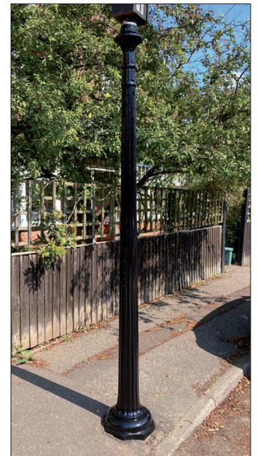
The traditional lamp posts before and after renovation. A big thank you to all the volunteers who pitched in to restore them.