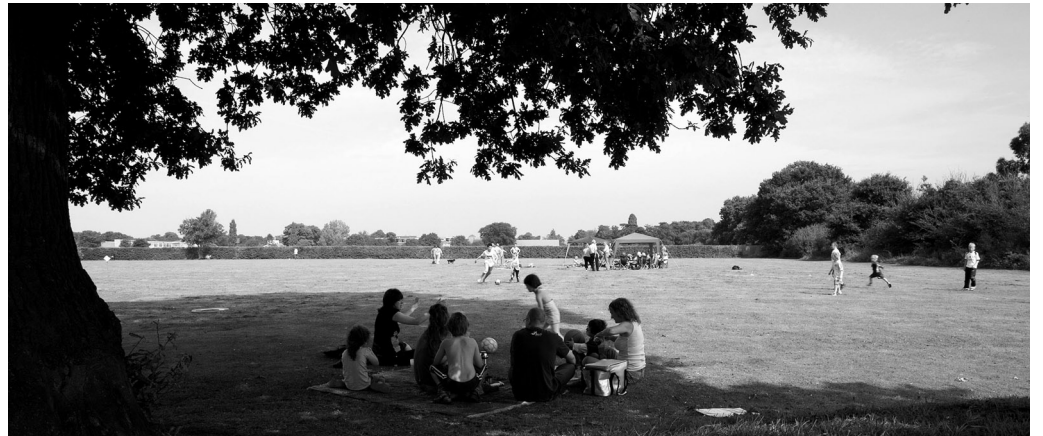
The Irvine Road Field, still fighting to keep it intact

As a result, the IRARA piggy bank is severely depleted and, coming at a time when several members of the committee will be standing down at the AGM, means we have an urgent need to raise some funds, recruit new members and re-vitalise the committee.