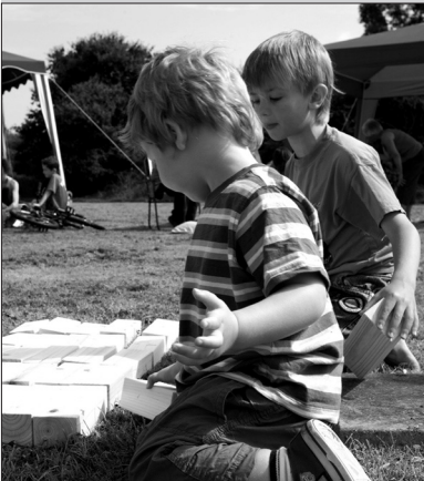
Local children enjoying their last open space

As before, it will be a very informal gathering and everyone is welcome, so come along, enjoy yourself and meet the neighbours.